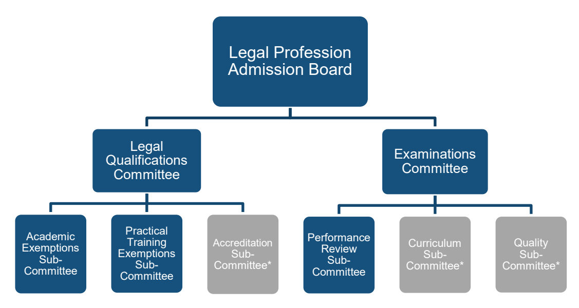
*These sub-committees were not constituted during the relevant period but are provided for in the Rules.

The LPAB's functions are also governed by the Legal Profession Uniform Admission Rules 2015, the NSW Admission Board Rules 2015, the Public Notaries Act 1997, and the Public Notaries Appointment Rules..