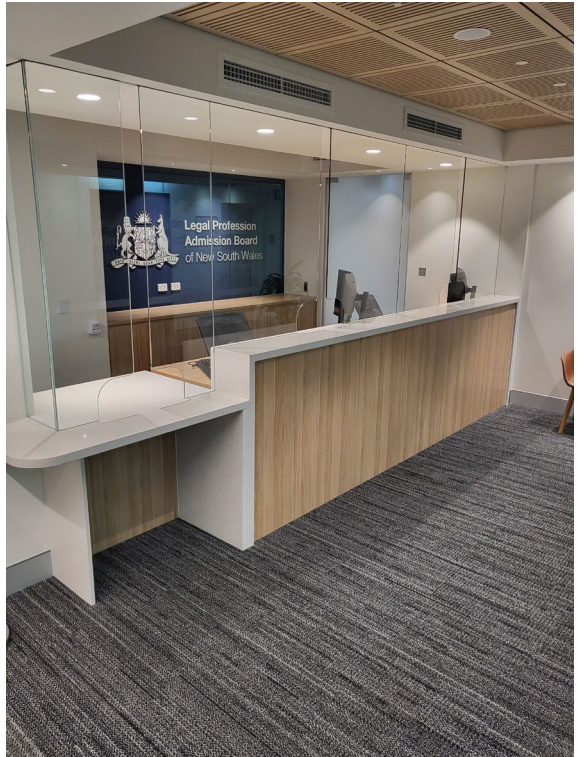
Figure 2: Public area

construction budget. This cost overrun was mainly due to site issues discovered after project commencement.