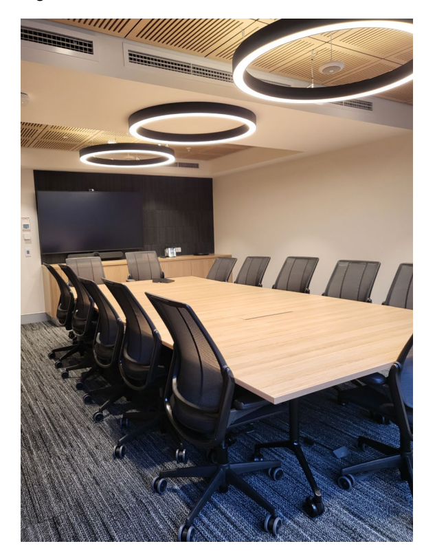
Figure 3: Board room